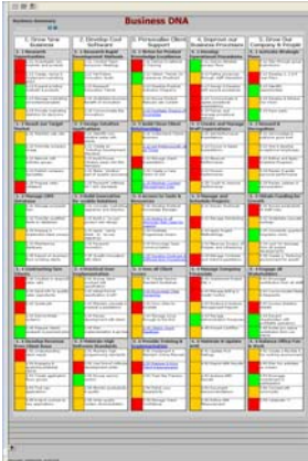
^^ ^^ ^^ ^^ ^^ ^^ ^^ ^^ ^^ ^^ This is a Business DNA